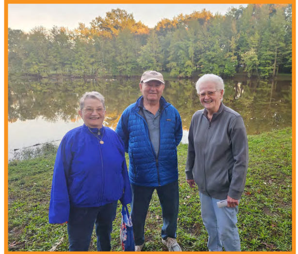
Tashlich with B'nai Israel at Holiday Park

To that end, we realize that security is not just an Israeli-homeland issue. We, too, are concerned with the increased level of antisemitism in the USA. We have decided to have an on-site armed security guard on Shabbos and at other shul events going forward. For any non-shul events, the sponsor will be required to hire security. It's sad that we have to do this, but these are the times we are living in. I look forward to a day when we can stand down from this heightened level of concern.