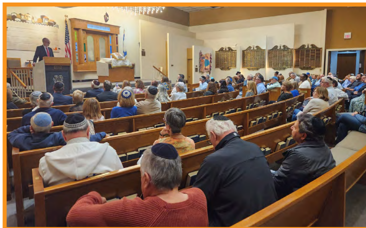
Israel solidarity night at the Synagogue

Rabbi Jonathan Sacks on the Parsha. Stay tuned for more details.