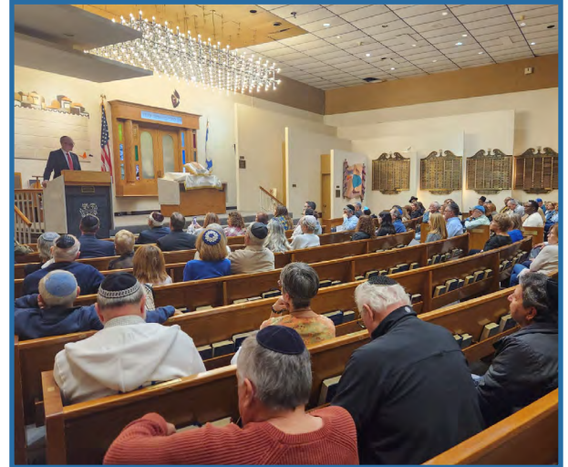
Prayer & solidarity gathering at B'nai Israel

On Thursday, October 19th, my mission began. Why does someone leave the comforts of home for a war zone? Why go from a desk job as a financial advisor to long hours of working on a medical supply base? To me the answer was simple. The work on the supply base is critical and someone must do it. Why not me: a child of Holocaust survivors, who cannot just sit and watch TV?