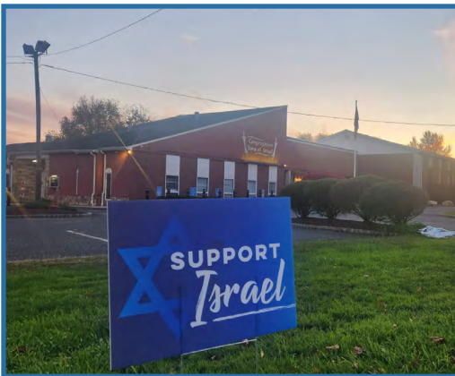
Sign in support of Israel outside the Synagogue

I have always believed that if there is a strong Israeli army, there would never be a Holocaust. Unfortunately, even this belief is on shaky grounds as antisemitism around the world has reached unprecedented levels lately. So, I left with Tefilat Haderech, the Travelers Prayer, in my pocket and a Red Bendl on my wrist. I said goodbye to my loving family. Lehitraot.